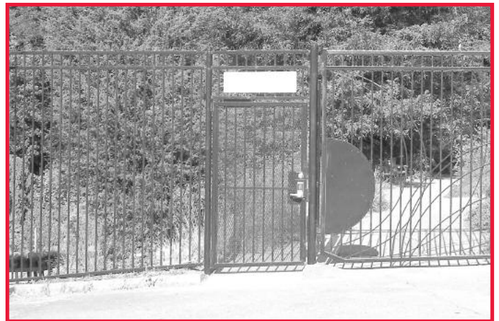
The "before" and "after" entrance to the Mather Redwood Grove.

participated in the exciting two-day event. After testing several scenarios around the new entrance in two previous sales, I believe we have finally arrived at an effective layout for plants and people. As another extension of the plant propagation program, our daily plant sales in the Garden Shop's plant deck have also continued to set records. You need no longer wait for an annual sale to get choice plants; in addition to regular mini-sales events ever few months, we are now offering choice material daily.