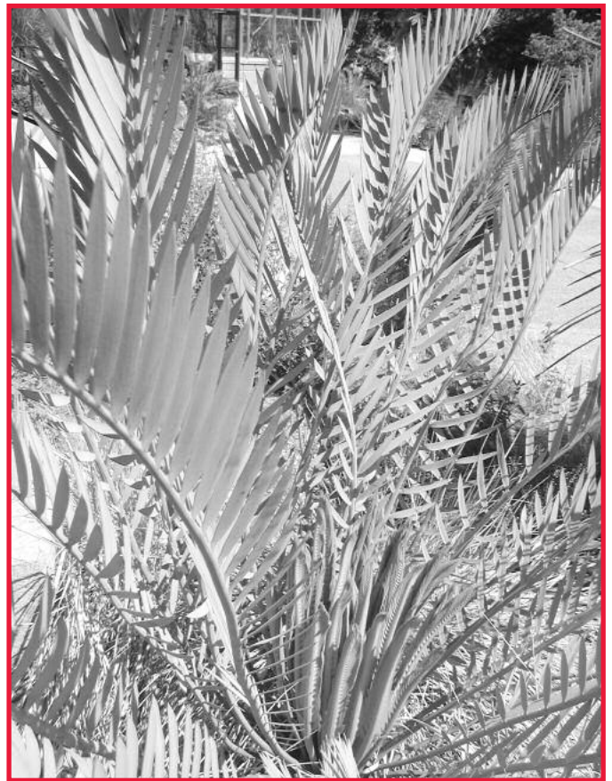
ABOVE A beautiful form of the endangered Encephalartos lehmanii graces the entrance plaza. LEFT: Several Macrozamia glaucophylla grace the Australasian Area.

non-existent in botanical garden collections. As reported in a recent Garden newsletter, Garden staff members are working on collaborative conservation projects involving a number of the particularly rare species. In addition to several botanical gardens in the USA, we are working with colleagues from the South African National Biodiversity Institute (SANBI), which includes Kirstenbosch National Botanical Garden, and with the Species Survival Commission for cycads of the International Union for the Conservation of Nature and Natural Resources (IUCN). We have obtained grant and private funding to initiate a breeding program aimed at producing propagules for re-introduction to the wild of certain very rare species. Cycad experts say that the San Francisco Bay Area has an ideal growing climate for this venture. We look forward to making a significant contribution to the worldwide cycad conservation effort.