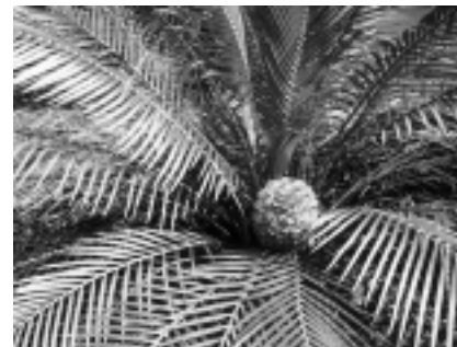
Macrozamia communis, a palm that is well suited to a water efficient garden..