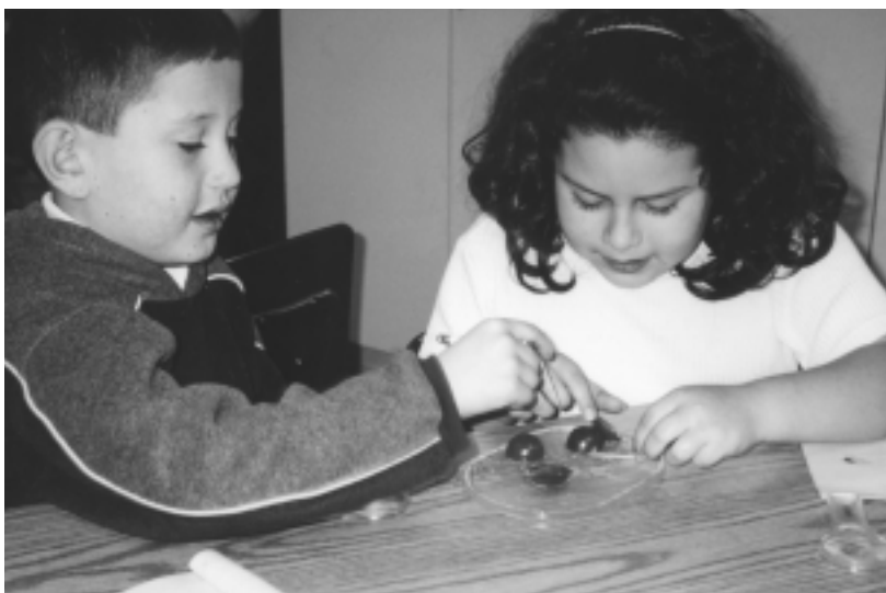
Second grade children at Lazear Elementary School in Oakland develop estimation skills as they explore the number of seeds in tomatoes of different sizes.

In conducting this project, we will work with 17 local and national community groups, including Girl Scouts, 4-H groups, after school programs in housing projects, and programs at other botanical gardens. The activities developed will be gathered into five to six Activity Guides in the Math in the Garden series, to be produced and distributed by a national publisher. Each Guide will organize activities into clusters that can be done at various points in the year. Areas of mathematics such as discovering patterns, making predictions, investigating numbers, measuring and comparing, and delving into geometry will be taught through planning the garden, then planting, composting, harvesting and renewing it. Background information will ensure that adult leaders can