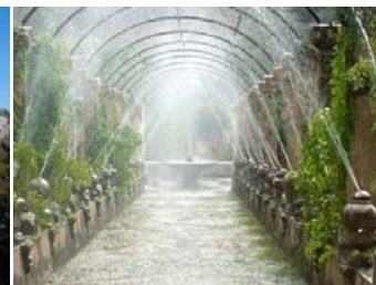
Gardens of Alfabia