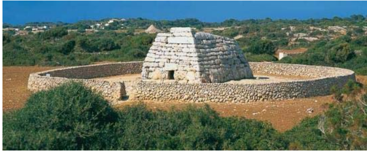
Naveta of Es Tudons

We are invited to an impressive private palace in Ciudadella for lunch, where we will enjoy a tasting of Menorcan specialties and its beautiful setting. Later we will stroll through the town's historic quarter, viewing its palaces and churches. We will stop for coffee in the town's quaint port before returning to Es Castell.