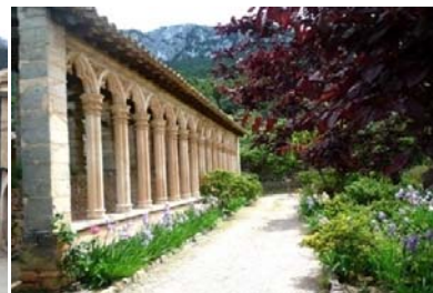
Views over Valldemossa and the cloister of the Monastery of Miramar.

Later we will visit the gardens of Miramar Monastery, created by Raymond Lully in the 14 th century, and the nearby Son Marroig, home of the late Archduke Luigi Salvatore Habsburg. We will continue our drive along Mallorca's spectacular North Coast to the village of Deia, home of the late poet and author Robert Graves, before returning to Palma for a free evening.