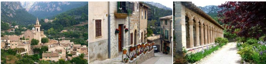
Views over Valldemossa and the cloister of the Monastery of Miramar.