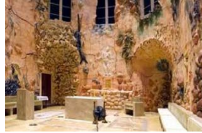
Miquel Barceló Chapel of St Pere

Lunch will take place in the restaurant of the Gran Hotel, a beautiful building by Art Nouveau architect Lluís Domènech i Montaner and seat of the Caixa Foundation. The afternoon and evening are free for further explorations of the city and dinner on your own. A list of shops and restaurants will be provided.