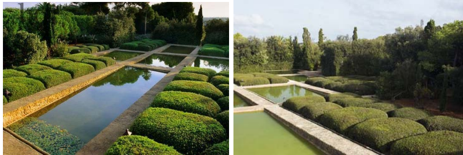
Camp Sarch by Caruncho.

Later in the afternoon we will visit Camp Sarch, a private agricultural estate. Starting in the 1990s, Fernando Caruncho, one of Spain's leading landscape architects and a friend of the family, converted the orchards and a small traditional garden into the beautiful gardens that exist today. The main garden has 16 ponds that alternate with beds of native plants and two pavilions. The project respects the existing structures, which according to Caruncho are of Moorish origin. Tapas and drinks will be served.