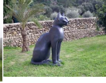
The Jakober Foundation and sculpture park

After lunch we return to Palma. Later in the afternoon we have an optional visit to Es Baluard, Palma's contemporary art museum. Our tour concludes with a farewell dinner at Es Baluard Restaurant, overlooking the Bay of Palma.